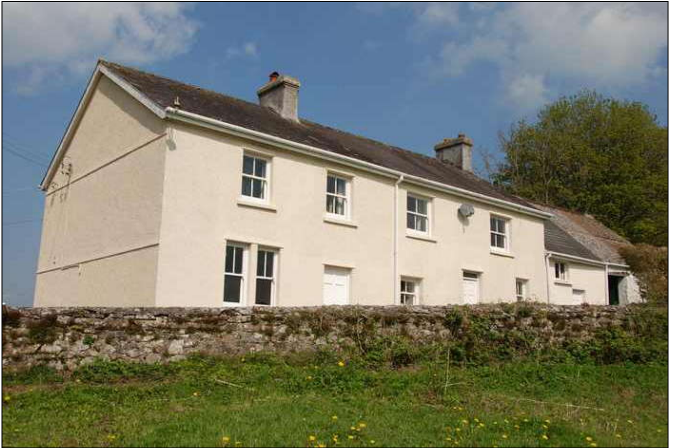
Looking at the farmstead from the property's pastureland, with Garn Goch beyond