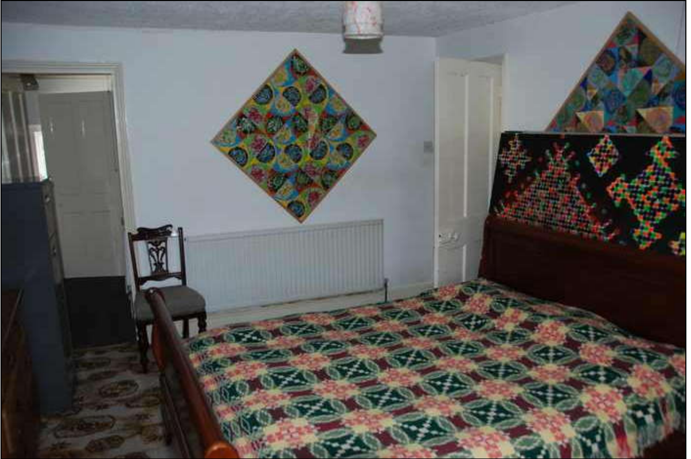
Master Bedroom 1