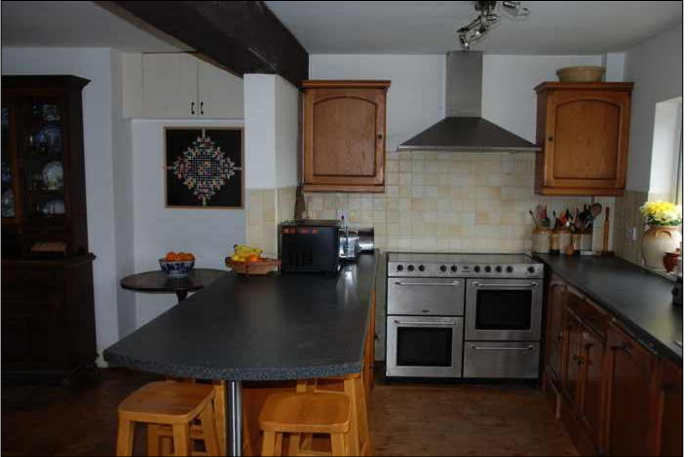
Open-Plan Kitchen/Dining Room