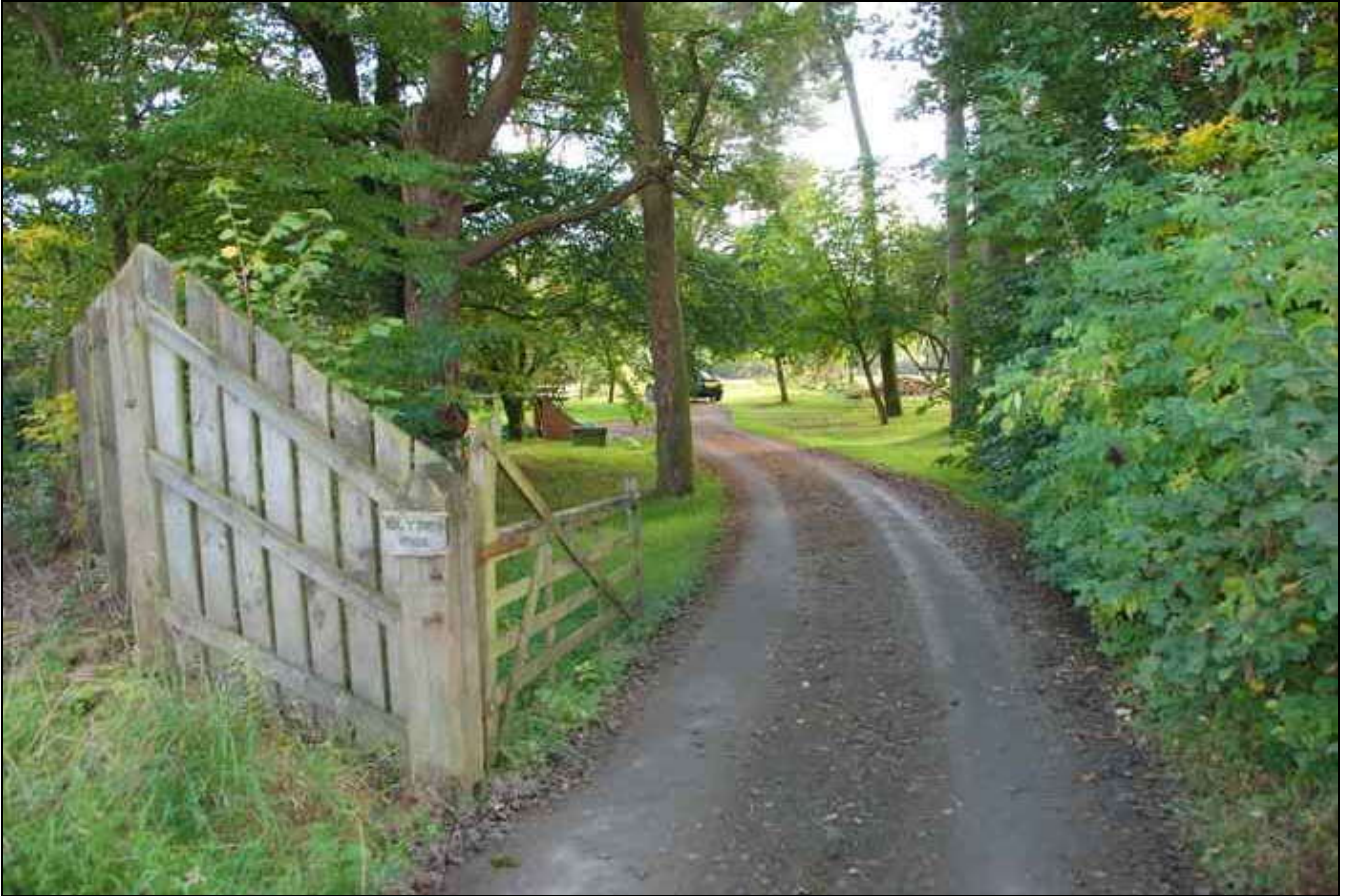
The entrance driveway