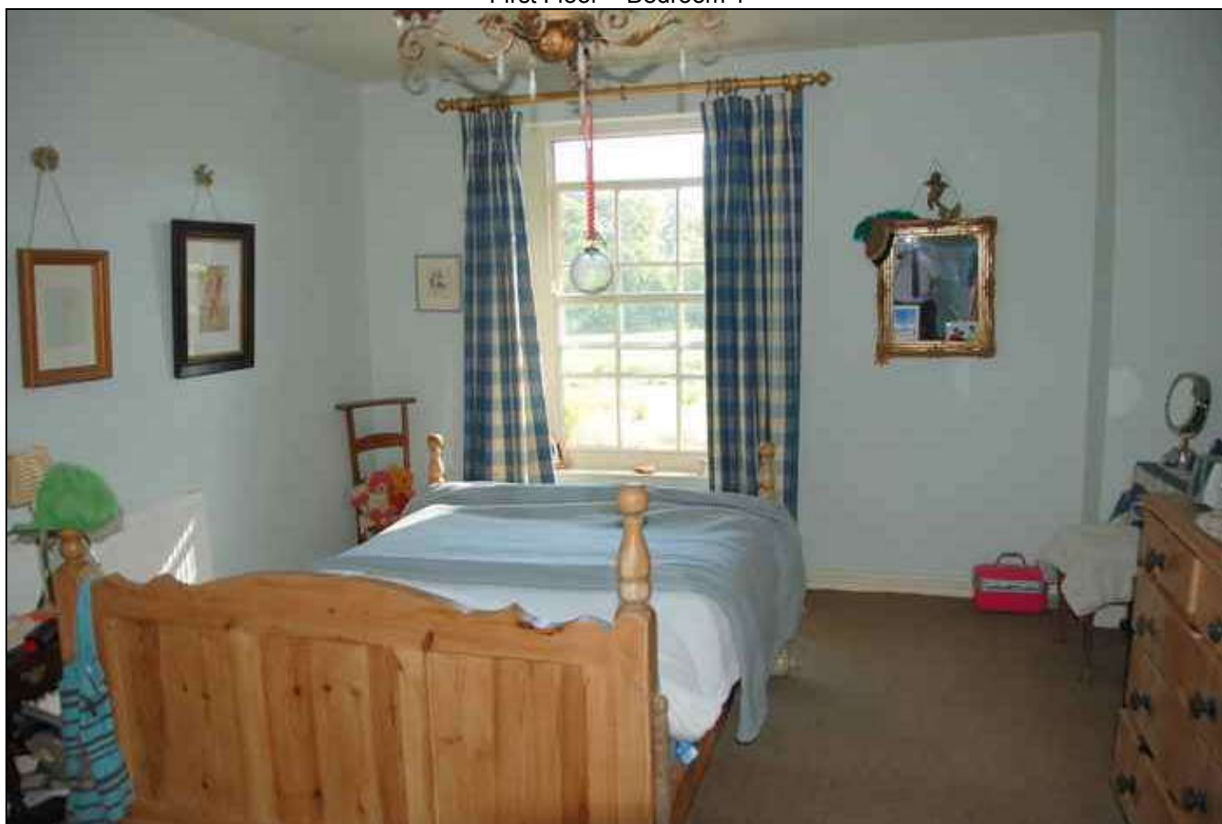
First Floor – Bedroom 1