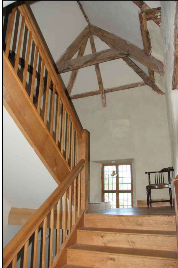
Oak staircase up to the Second Floor