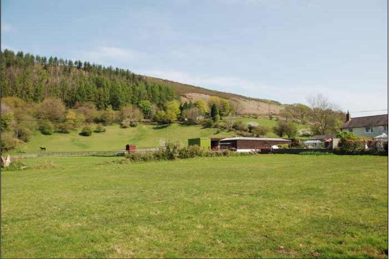
Looking at the rear of the house and stable yard from the property's land