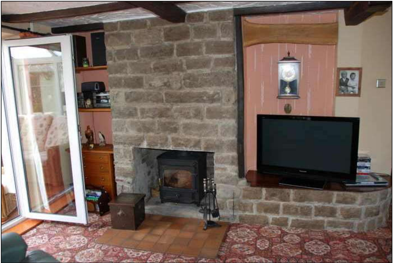
Main Conservatory accessed from the Lounge