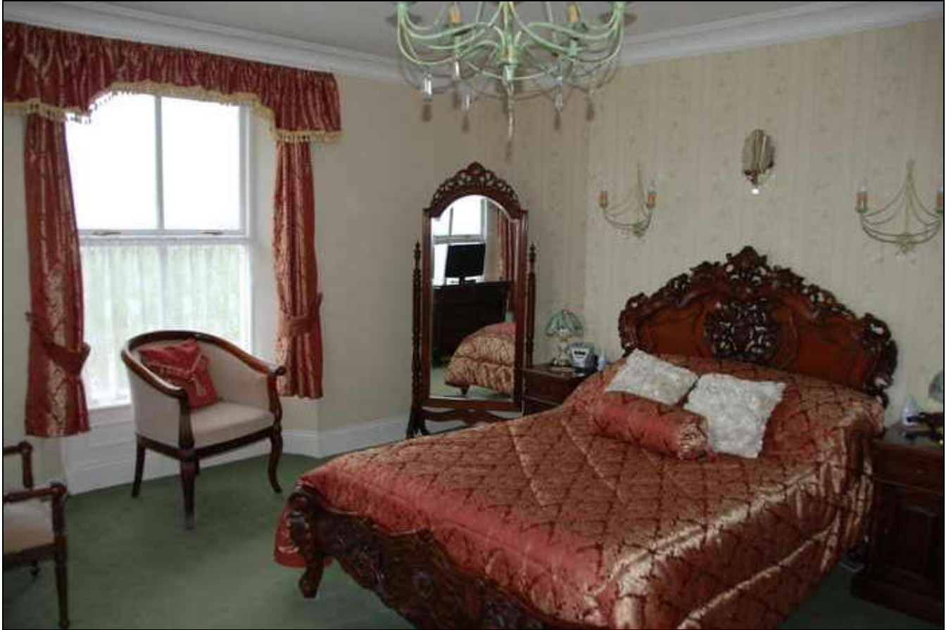
First Floor – Master Bedroom 1