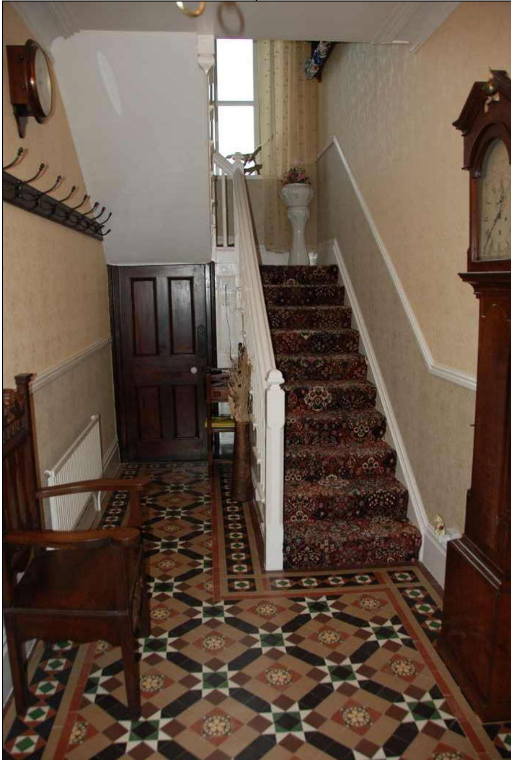
Staircase from the Reception Hall to the first floor