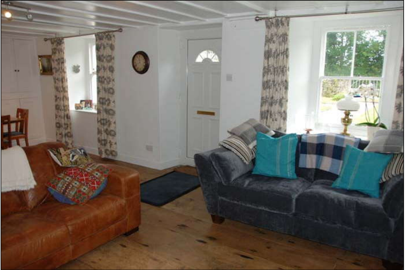
Living Room/Dining Room