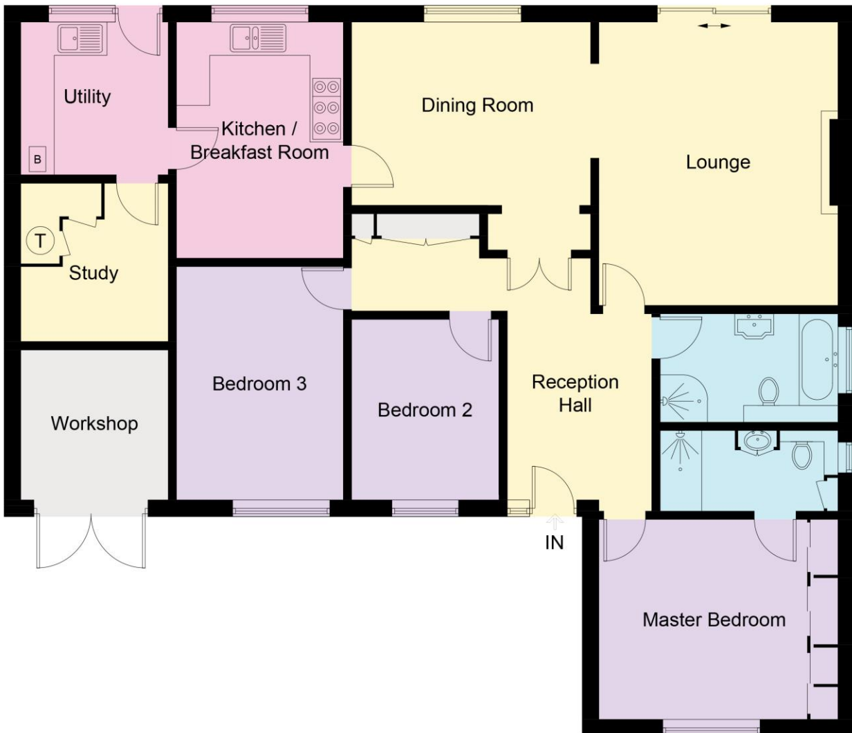
Illustration for identification purposes only, measurements are approximate, not to scale. FloorplansUsketch.com © 2019 (ID516438)

Approximate Gross Internal Area = 144.3 sq m / 1553 sq ft